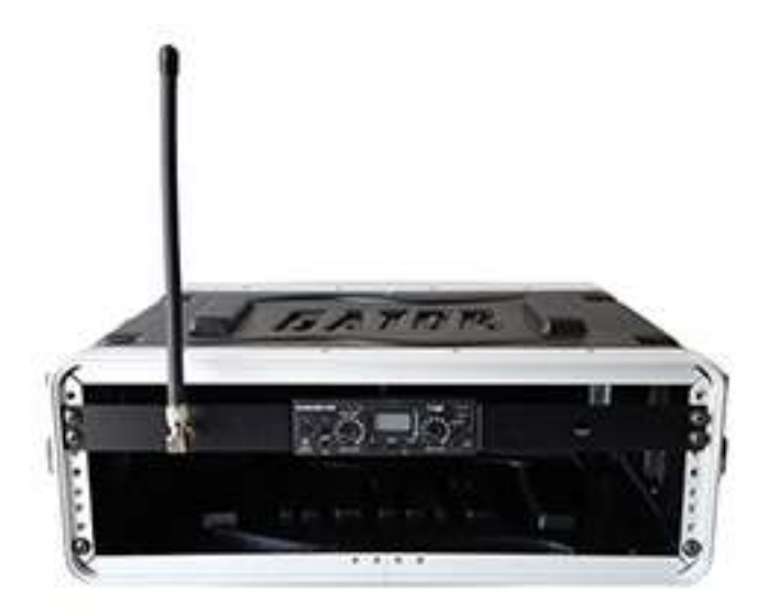
RM-501 Single Rack Mount Kit for T-500

Allows to mount 2 Enersound T-500 FM transmitters on a standard 19" rack.