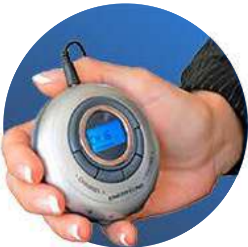
R-120 receivers with headphones