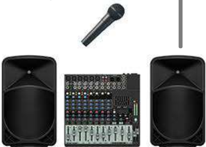
Interpreter Microphone and headphones