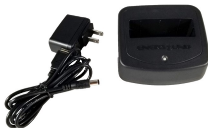
OPTIONAL CHR-600 Single Drop-In Charger with Power Supply & USB Cable.