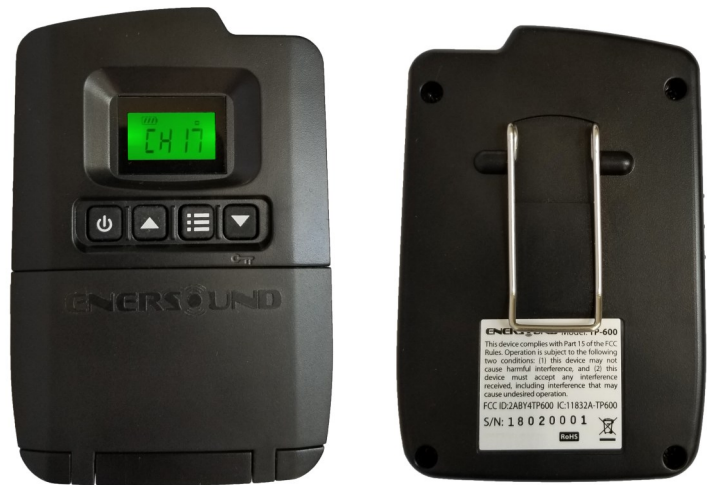
TP-600 Multichannel Battery Operated Transmitter